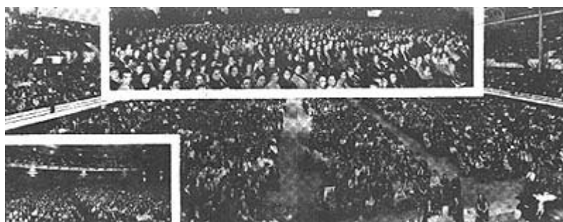
Scenes from the meeting in Houston where the amazing photograph at left was taken. The lower photograph was the audience that attended in the Sam Houston Auditorium.

one of the most amazing photographs in the history of all-time was taken in Houston, Texas. It occurred in the Branham meetings then being held in that city. From night to night God's power was revealed, and in the case of practically every person dealt with, Brother Branham was able to discern not only the affliction but anything that was interfering spiritually with the person seeking healing. Unconfessed sin was promptly called out. This action of the Spirit revealed to the audience how important it was for people seeking healing to surrender their lives completely to God.